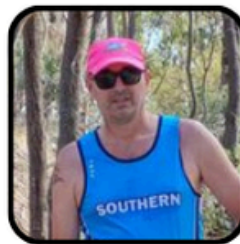
Glen Cuttance Road & Trail Coordinator