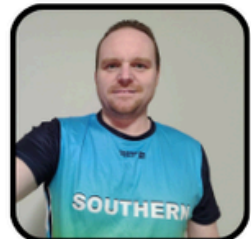
Dale Grimmond Website Development